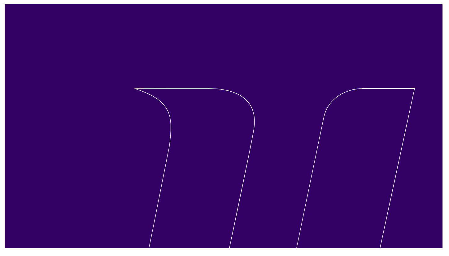
EuroPsy – the European Certificate in Psychology